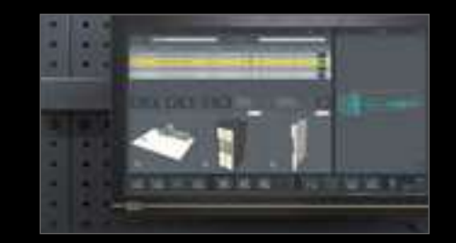
With the help of the module Storage Location Management every storage location of tools and accessories is entered and known – both in the Smart Cabinets and in storage systems.