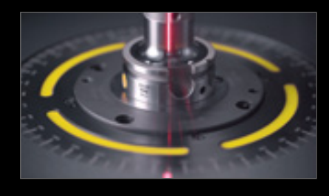
The balancing adapter with center offset is designed with a two-point contact and a pressure element. These features enable a large and more measurable sensor signal.