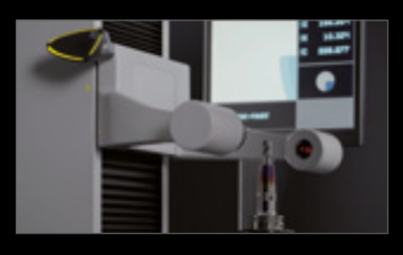
By scanning the ZOLLER »idChip« on the presetting and measuring machine, the tool data is called up directly and the measurement sequence can start.