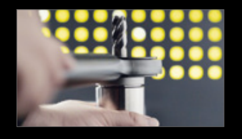
The assembly of the tools at the workbench is supported by assistance systems such as the assembly assistant or stored help.