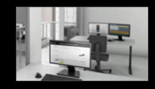
In our webshop you can get the digital twin for the tool-holding fixture, which can be used immediately in your CAM and tool management system.

Scan the QR code and experience the ZOLLER Smart Factory Solutions in the video!