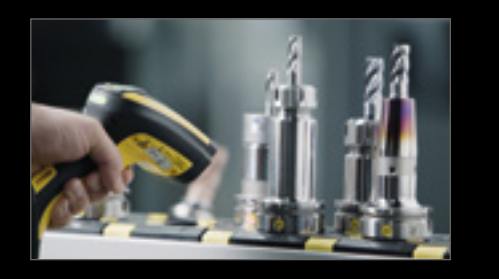
With ZOLLER »zidCode 4.0« you transfer all digital tool data to the CNC control without any typing or transmission errors.